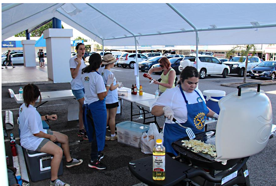
Customer number 1.

I'm told it was a good day. They really are an impressive group of young people.